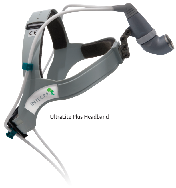
UltraLite Plus Headband