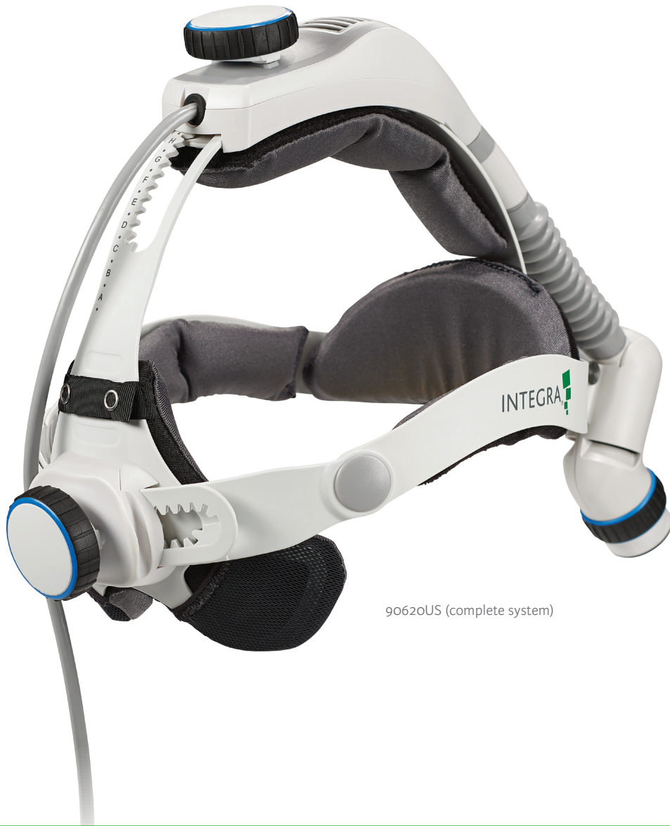
90620US (complete system)