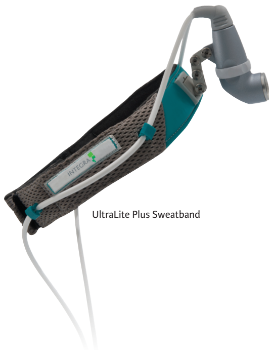
UltraLite Plus Sweatband